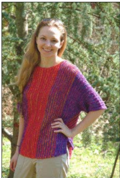
Cotton Flake Metallic Top